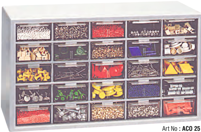
Art No : ACO 25

Ideal for storing electronic parts, hardware etc. Suitable for homes workshops and factories. Comes with clear see through plastic drawers for easy visibility of contents.